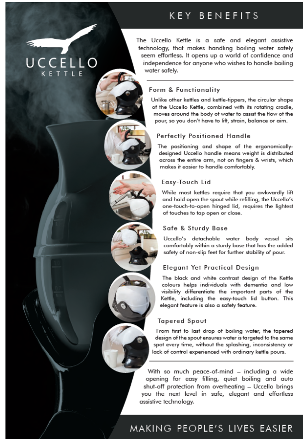
Front of flyer