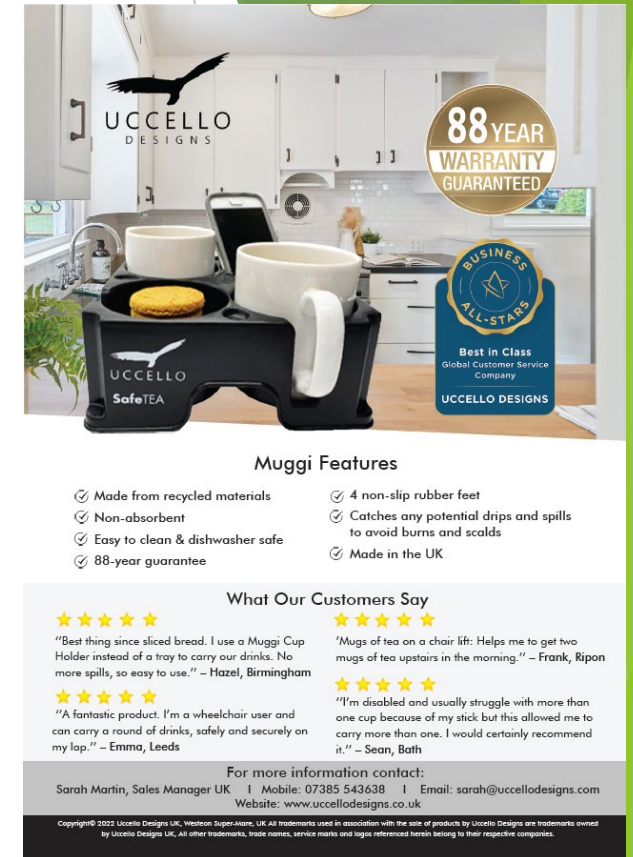
Back of flyer