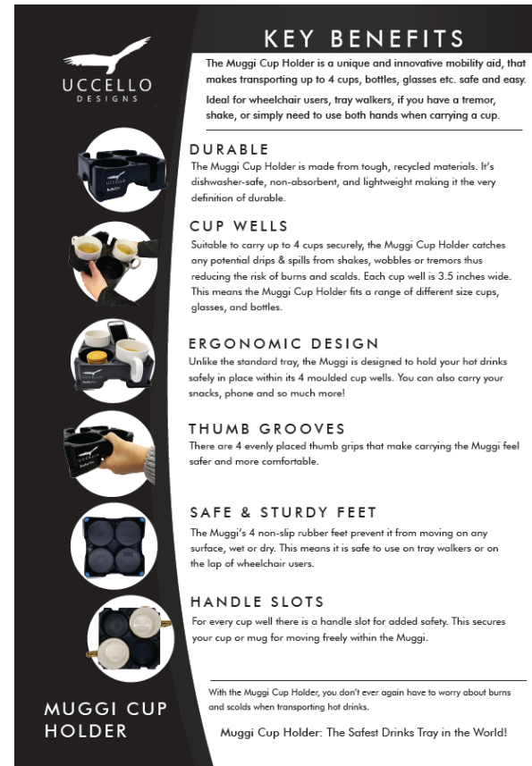
Front of flyer