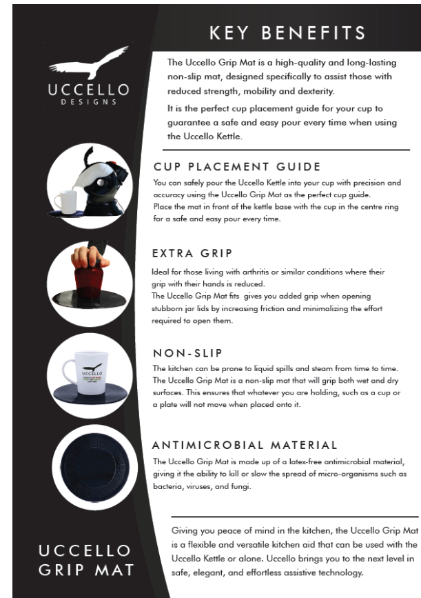
Front of flyer