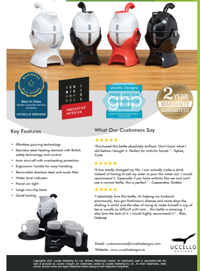
Back of flyer