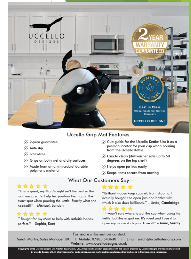
Back of flyer